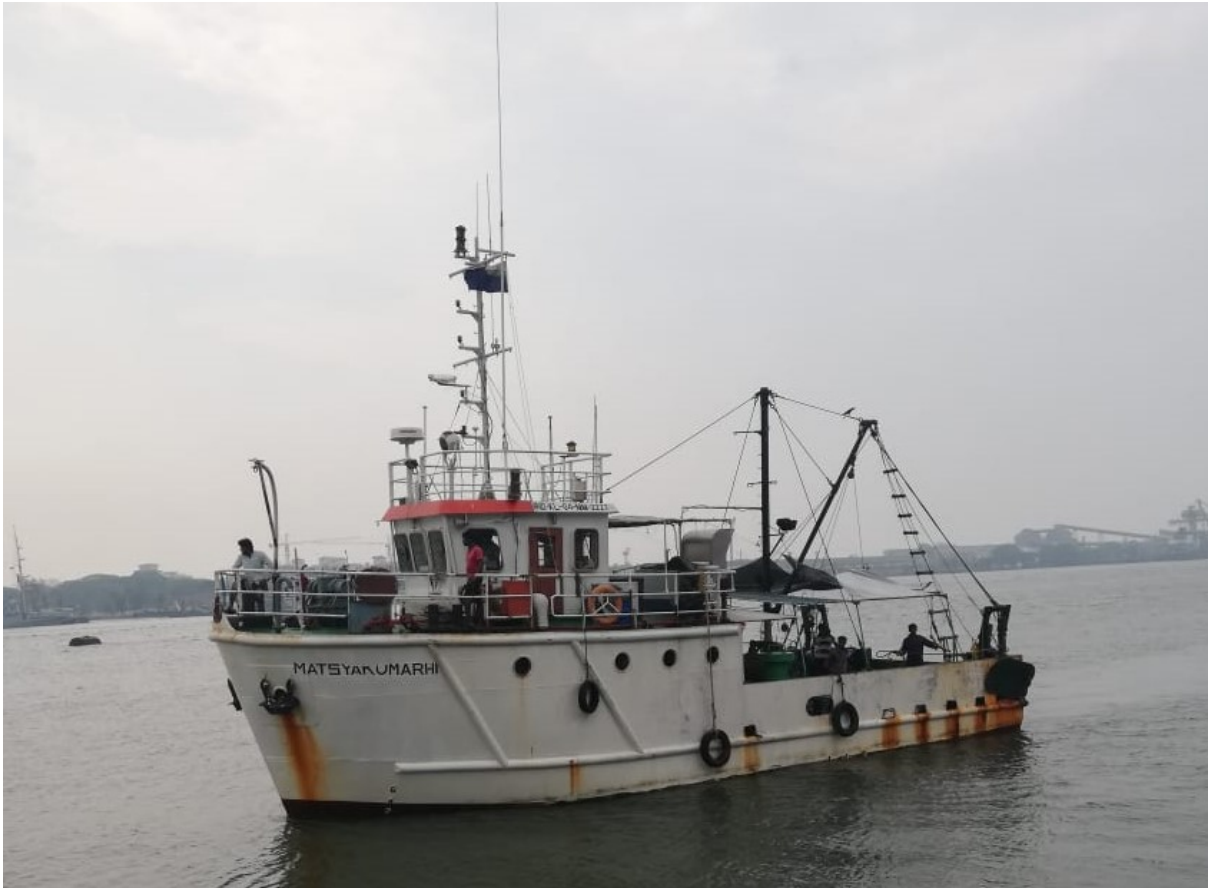
Fig:1 Boat Photograph